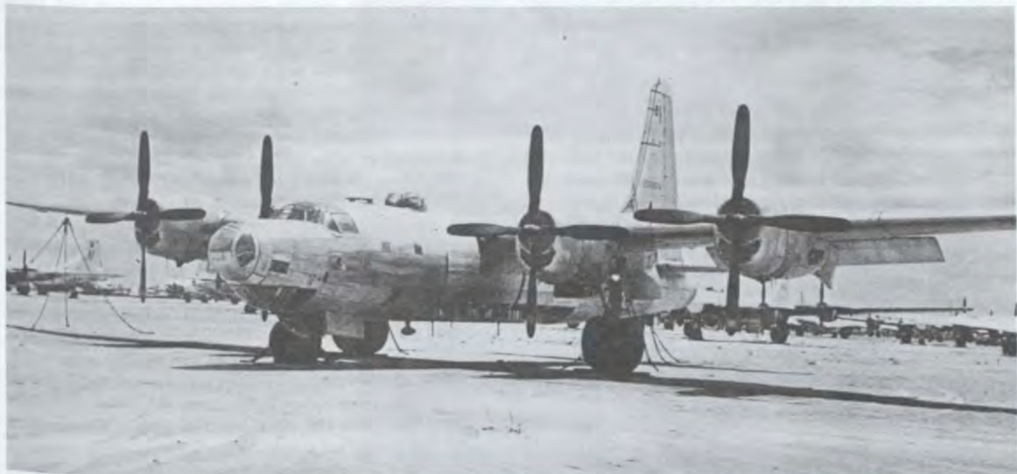
This photo of the fourth production Dominator, B-32-1-CF 42-108474, was taken at Davis-Monthan Air Force Base sometime between September 1946 and August 1949. The aircraft had been preserved for planned exhibition at the Air Force Museum, but was finally scrapped in August 1949.

If anyone knows of fellow crew members or friends who served in the 389th BG and do not belong to the 2nd Air Division Association, please send me their names and addresses, and we shall endeavor to get them to our reunions.