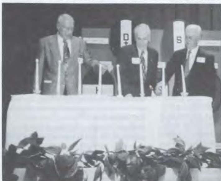
Lighting the 6th Candle

See you next year — last Saturday in February — same place! ■