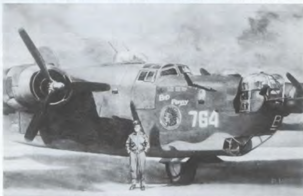
B-24J "THE BAD PENNY"

clerk had opened the door of our Quonset hut at 0415 hours to call us to briefing. As we pedaled our bicycles to breakfast, the damp fog of this early British dawn cut through our uniforms.