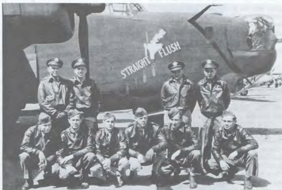
THE MARIS CREW AND THE B-24 THEY FLEW OVER THE ATLANTIC