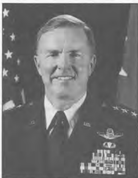
LT. GENERAL THOMAS J. KECK

L t. General Thomas J. Keck is commander of the 8th Air Force, Barksdale Air Force Base, Louisiana, and also serves as an Air Force Component Commander for the United States Strategic Command, Offutt Air Force Base, Nebraska. His command of the central United States and Atlantic Ocean territory is comprised of seven wings and two groups. This includes nearly 500 aircraft and about 44,000 people, including 14 gained Air Force Reserve and Air National Guard units. He oversees the warfighting capability of this numbered air force's B-1, B-2, B-52, F-15, F-16, A-10 and HH-60 aircraft.