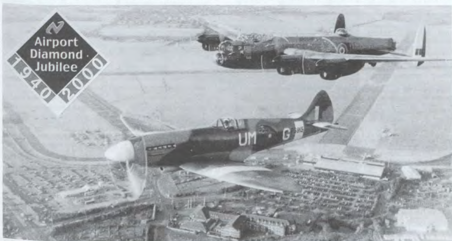
HISTORIC SHOW: The Battle of Britain Memorial Flight over Norwich Airport.

There will be a two-day air show celebrating sixty years of flight at Norwich Airport on August 5 & 6, 2000. The airfield, which initially was