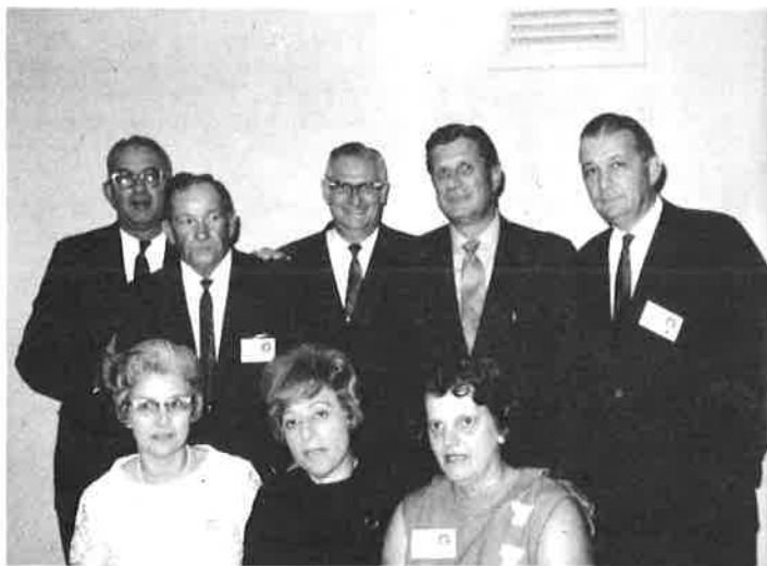
Did you say the Original Pickhandlers?